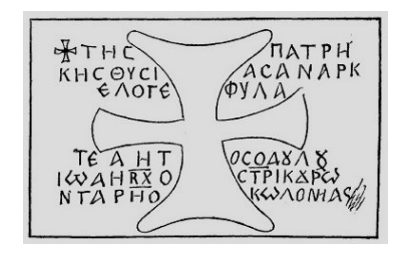
Fig. 5. Ioannes' inscription (after Taylor, 1868)

S. Ioannides visited the site in 1870. He spotted the eagle above the outer walls' entrance, as well as the droungarios' inscription in the church, which he erroneously linked to Ioannes, bishop of Koloneia (just