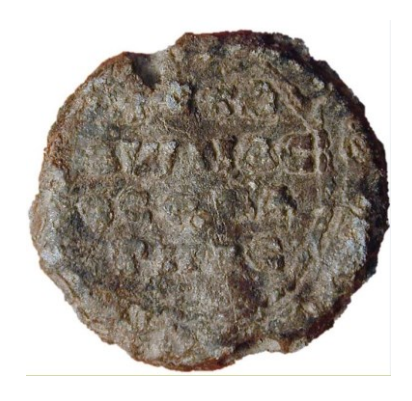
Fig. 4. IFEB 1063 reverse