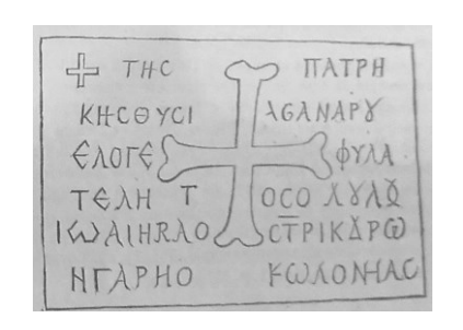
Fig. 6. Ioannes' inscription (by De Courtois, after Waddington and Le Bas, 1870)