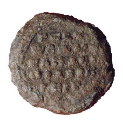
Fig. 3. IFEB 1063 obverse (photo J.-Cl. Cheynet)

Epigraphic criteria suggest a date around the second quarter of the 11th century. We know that since the 960's and until ca. 1025, the theme of Koloneia was somehow associated with that of Chaldia (as evidenced by seals). In 1021, Basil II ceded the area of Sebasteia to Senakhereim, an Armenian nobleman, but very soon it was taken back by the Byzantines, under the governorship of Basileios Argyros.<sup>6</sup> Argyros was soon after removed from his office, and it is very likely that either during the time of his service, or a little later (but probably before the revolt of Isaakios, in 1057) the central authorities tried to connect the theme of Sebasteia, which was not properly organized after the recent events, to that of Koloneia, which was a fully functional theme at that time. Thus, it is not surprising that we find a krites (judge) with the two themes under his jurisdiction. Apart from his duties as a judge, this person also served as anagrapheus, a fiscal official. It must be stressed here that the fine line between civil and fiscal officials in Byzantium is not always clear. Sometimes people were entrusted to occupy more than one position or their office demanded engagement with both the civil and fiscal sector.